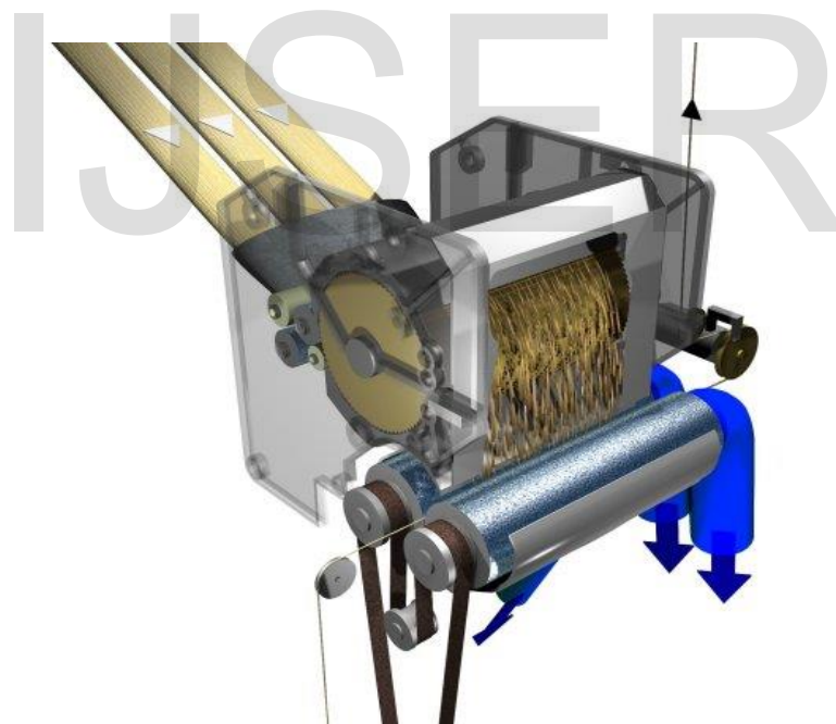
Fig. 3. Dref 2000 Spinning Machine

- Winding the yarn: The yarn passing through the conveying device is wound crosswise in bobbin form.