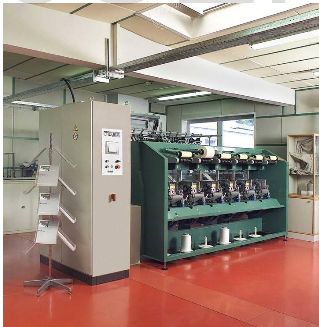
Fig. 1. Dref 2000 spinning machine production center showroom, Linz (Austria)

The amount of twist given to the yarn is the ratio of the number of turns the spinning rollers make around themselves to the production speed. However, the amount of twist given to the yarn is generally lower than the predicted value. This is due to the slippage between the yarn and the spinning cylinder surface.